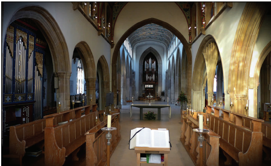
The Cathedral, chairs cleared away, in preparation for a School Visit

BETWEEN September and December 2017, the School Visits Team welcomed 1,023 children aged from five to eleven years old to the Cathedral. Some of the children who visited came from Church schools and some from Local Authority schools.