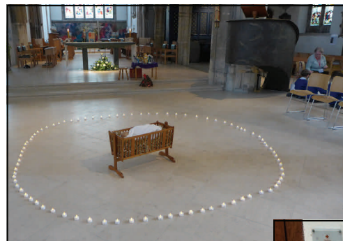
Just two of the activities the School Visits Team lead the children through on their visit to the Cathedral

We would like more people to join our team, the main qualifications are a love of working with children, a willingness to learn and to be able to work as part of the team. If you are interested or would like to know more please contact me at m.emuss_ccathedral@hotmail.com