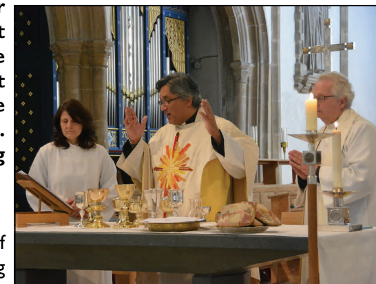
The gifts being blessed at the last stewardship campaign in 2015

Two years ago we had a major focus on teaching about financial giving. The response was tremendous - it meant that our congregational life had proper financial support. Next year we will be doing that again.