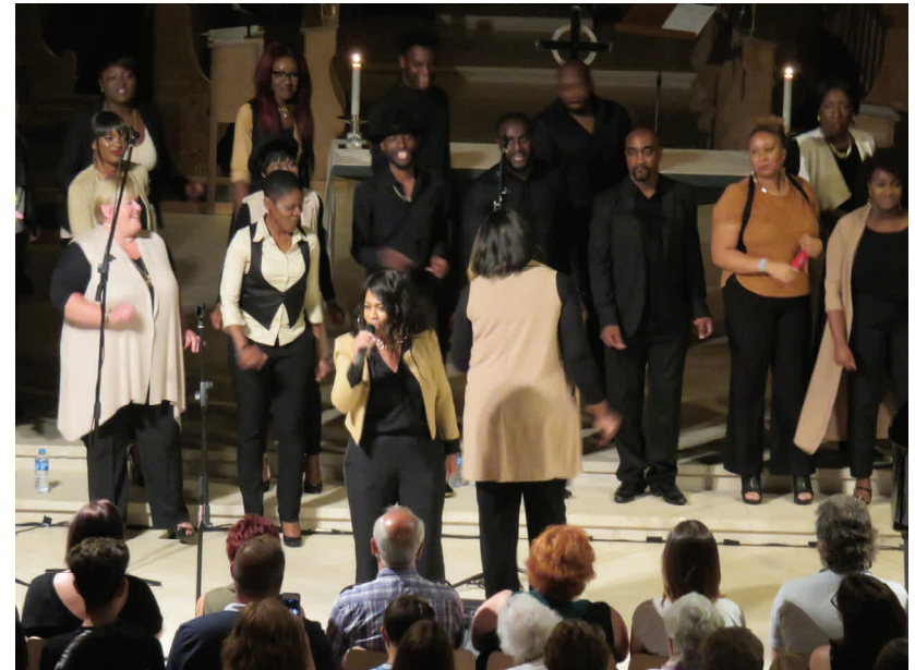
LCGC performed with the BIG sing choirs at a sell-out concert at Chelmsford Cathedral last Saturday.