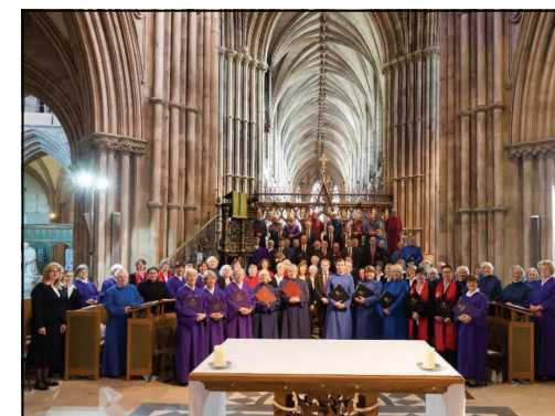
Members of the Voluntary Choir at a festival in Lichfield Cathedral in 2015

FOR over a decade the Cathedral's worship has been regularly served (in addition to the Cathedral Choir and Girls' Choir) by an entirely voluntary group of singers, singing choral services in choir holidays and in term time, giving annual performances of Stainer's Crucifixion and Wood's St Mark Passion , occasional combined services with the Cathedral Choir and Girls' Choir, as well as representing the Cathedral at Voluntary Choir Festivals around the UK.