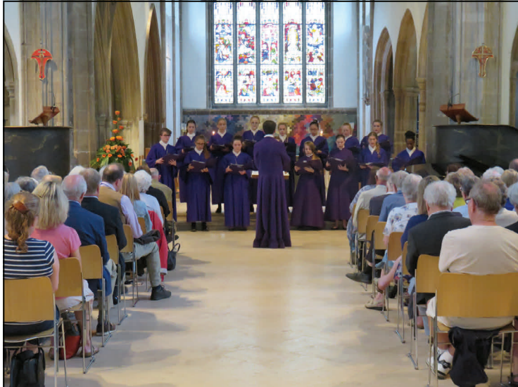
The Girls' Choir performed several pieces to celebrate St George's Day including Elgar's The Banner of St George