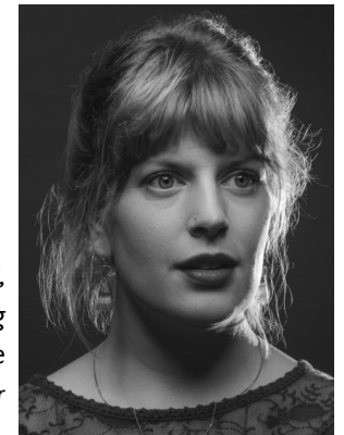
Sarah Perry, who is giving the final lecture this year