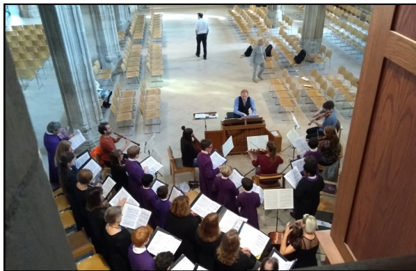
Photos taken at the rehearsal