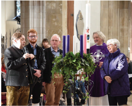
The Advent Procession.

Visitors from Backnang presented the Cathedral with an Advent candle.