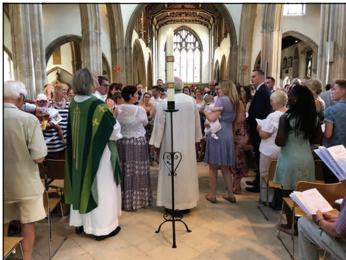
Earlier in July, the Cathedral celebrated a number of baptisms for families living in the parish and members of the Cathedral community. It was good to welcome new members into the Church family.