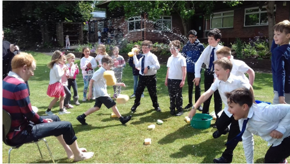
The choristers flinging wet sponges at a very well dressed choir master!